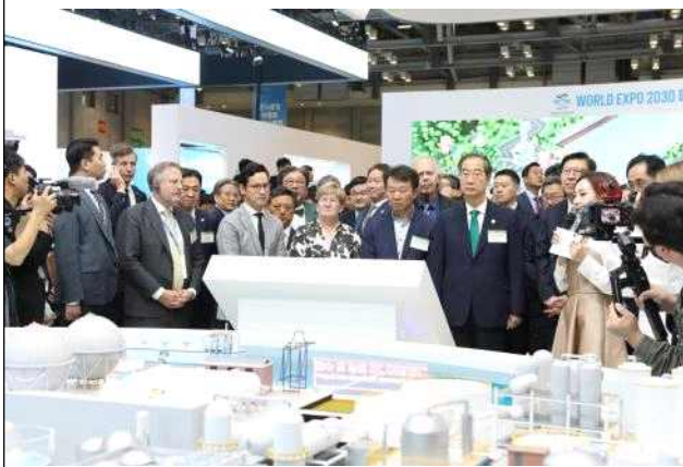
Exhibition Hall Tour (5/25)