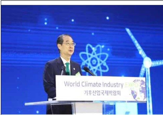
Opening Ceremony Speech by Prime Minister Han Deok-su (5/25)