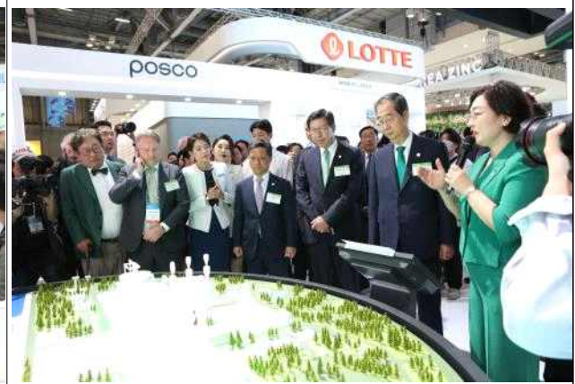
Exhibition Hall Tour (5/25)