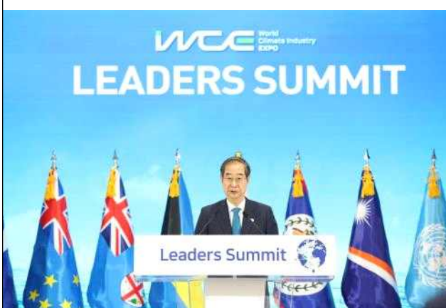
Leaders' Summit Address by Prime Minister Han Deok-su (5/27)