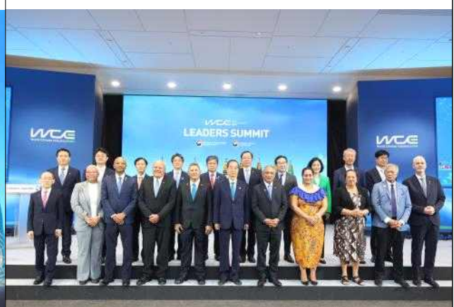
Leaders' Summit Group Photo(5/27)