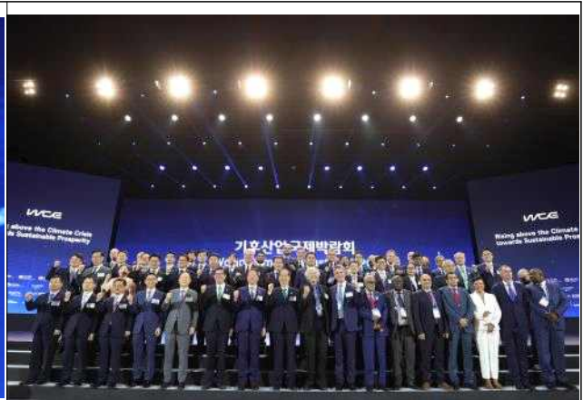
Opening Ceremony Group Photo (5/25)